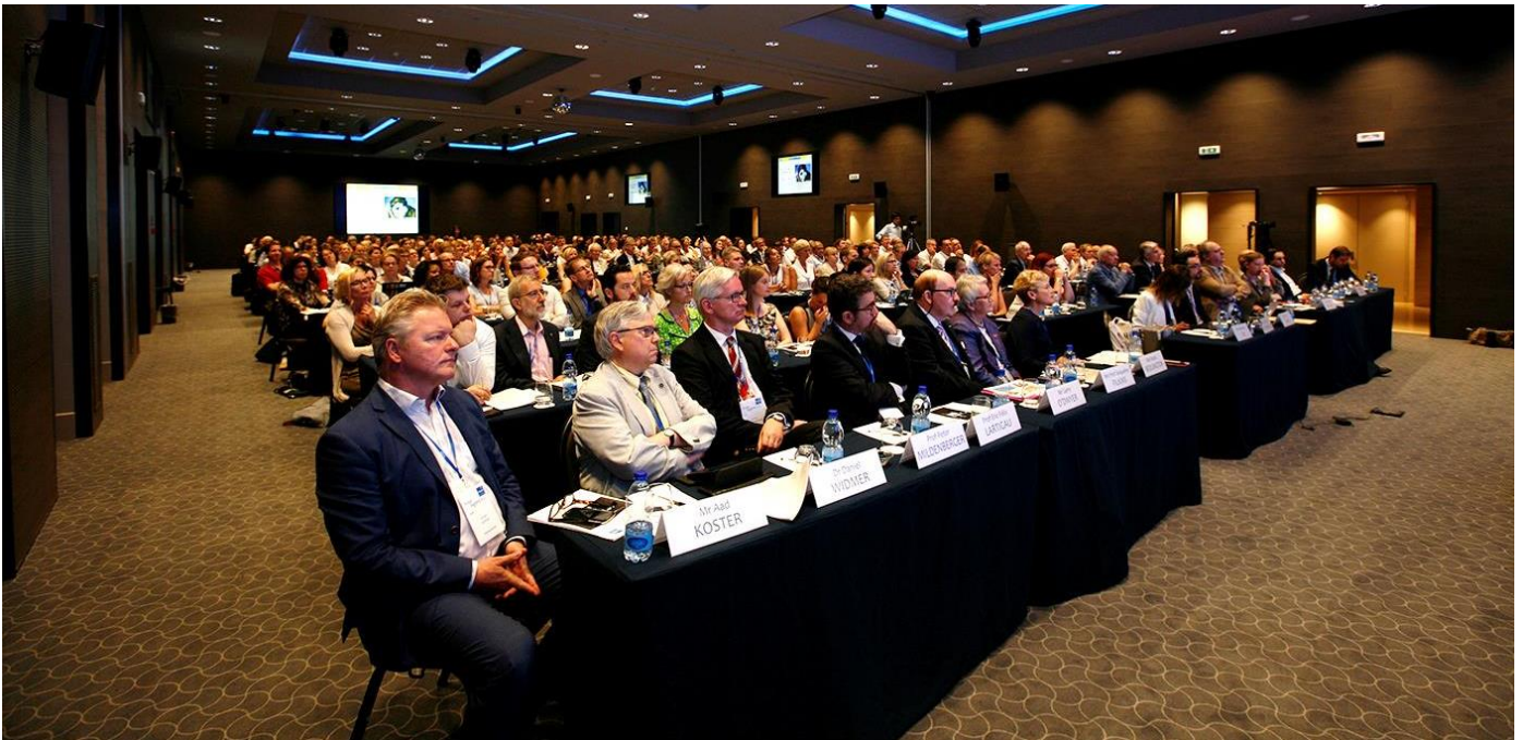
Picture from the HOPE Agora 2016 held in Rome.

http://www.hope.be/hope-exchange-programme/