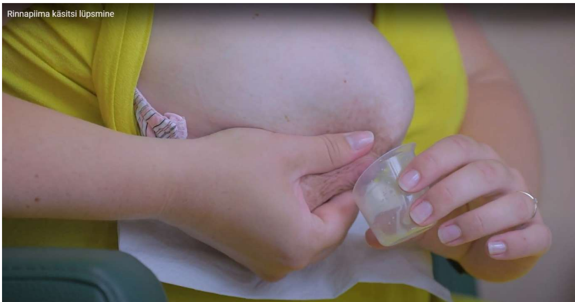
Figure 3. Hand expression of breast milk.

It may take a few minutes for the milk to flow, so be patient. After a while, change the position of your fingers on the breast to empty other milk ducts. Then move to the other breast and repeat the process.