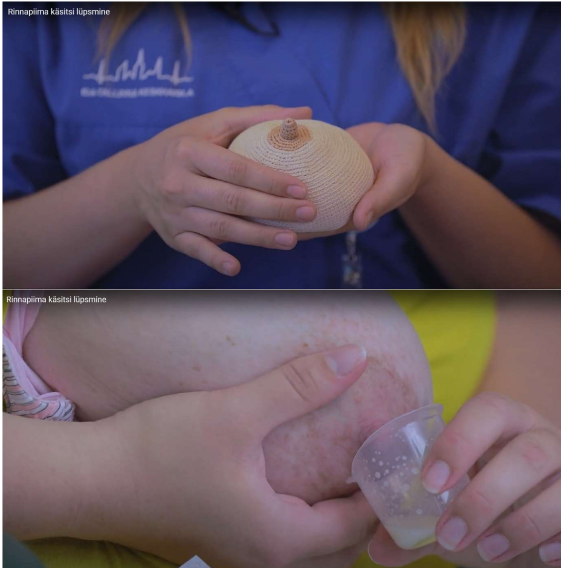
Figure 2. Position of fingers when expressing breast milk by hand.